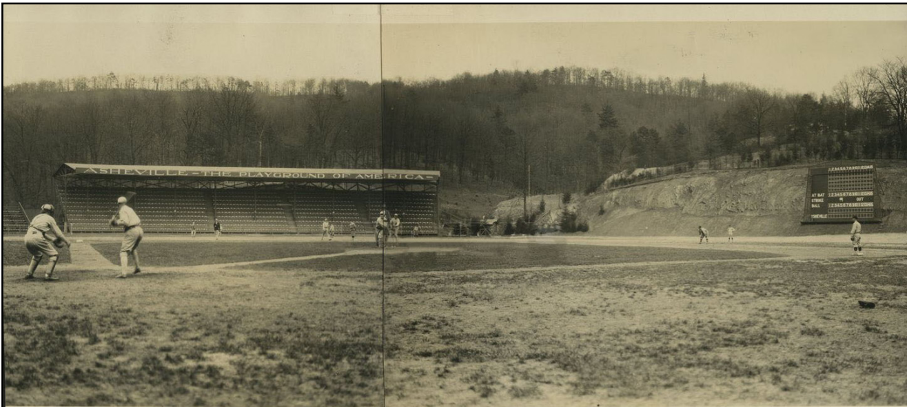
Masa's photo number, title, date, logo credit -----, Asheville baseball field and players, 1926 5 x 10.5 inch print